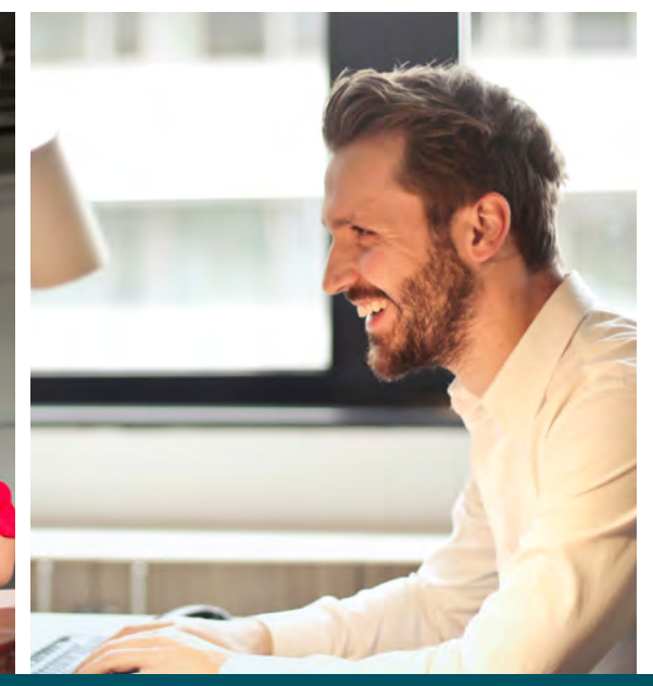
IT Systems Administrator Candidate information pack